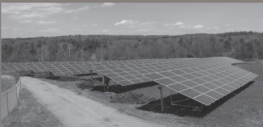
This solar array in Lunenburg is providing energy credits to lower the electricity costs for several manufacturing plants in the area which use high levels of electrical power.